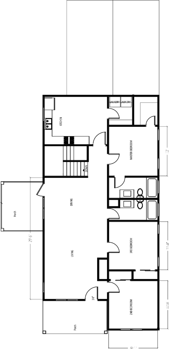
Closed Kitchen Plan